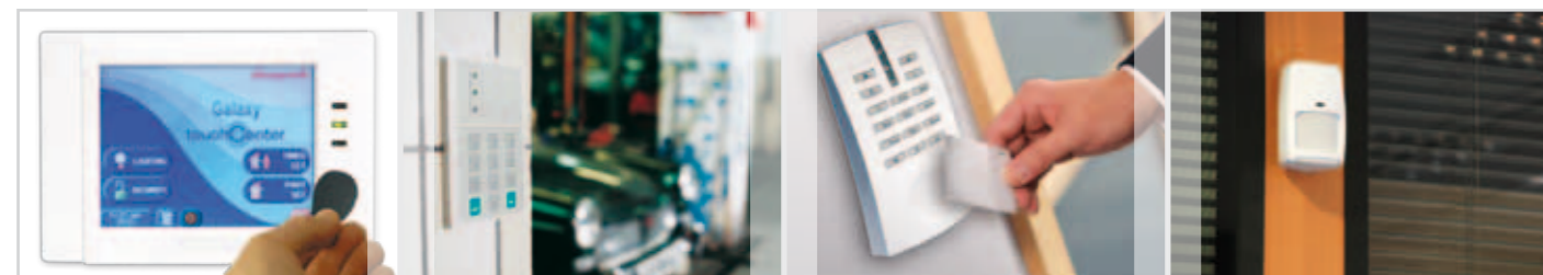
Galaxy® Dimension TouchCenter

Class-leading peripherals: using the latest technologies